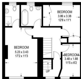
FIRST FLOOR = 61.2 SQ M / 659 SQ FT