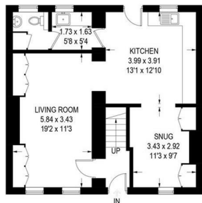
GROUND FLOOR = 61.4 SQ M / 661 SQ FT

APPROXIMATE GROSS INTERNAL AREA = 167 SQ M / 1798 SQ FT